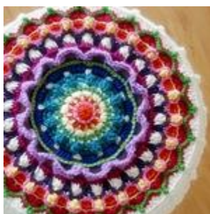
Mandala & Stool Cover