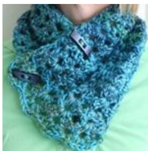
Sea Ice Cowl