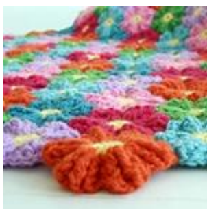
Waikiki Wildflower Blanket