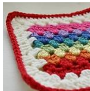
Granny Stripe Square