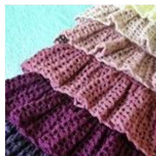
Ombre Ruffle Blanket